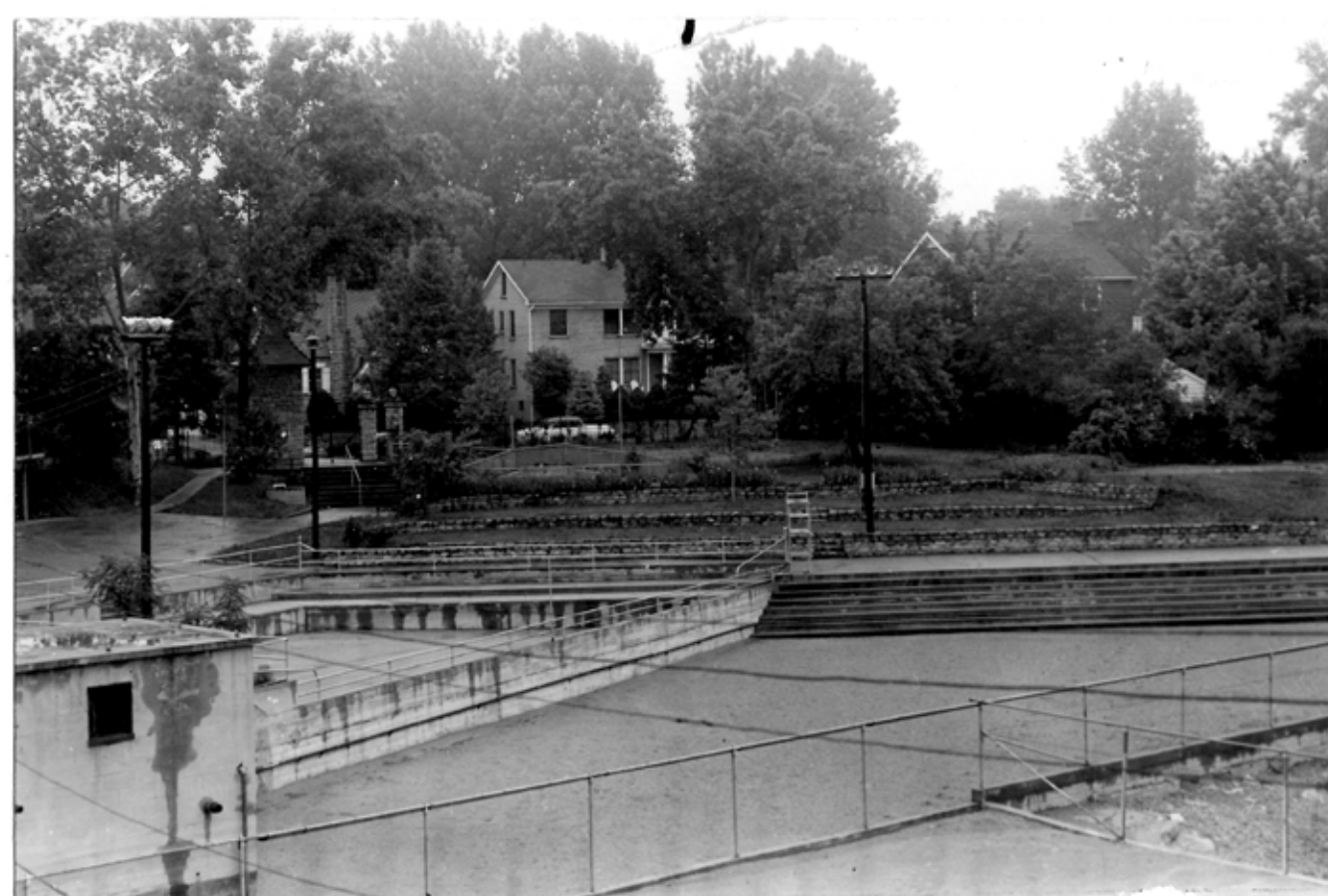
SECOND PUMP HOUSE THAT WAS RUN ELECTRICALLY. FIRST SHALLOW LAKE AREA.