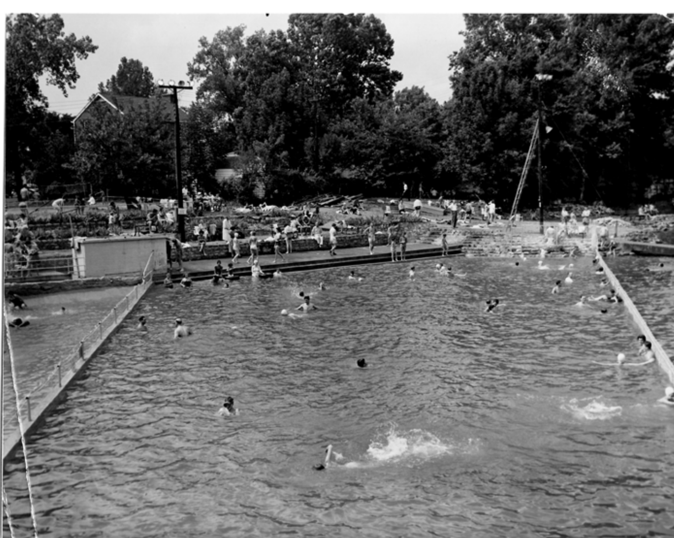
FIRST PUMP HOUSE (IT HAD A GASOLINE MOTOR) IN 1947